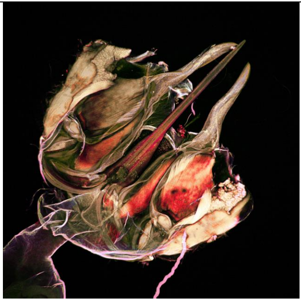
Image of Distinction “Stinger of Honey Bee” Nikon Small World Photomicrography Competition 2015